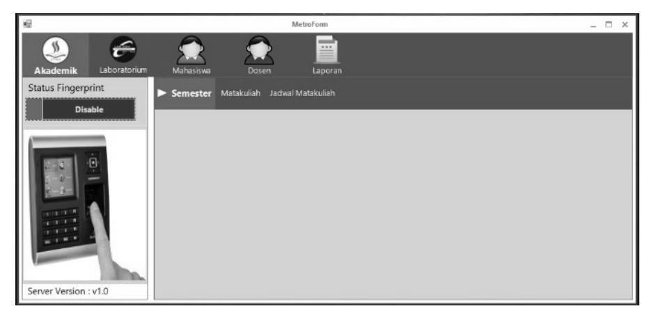
Fig 2 Application for Monitoring

Results from the design hardware and software that we have done, can be realized as a prototype that can be used with real input data. Prototype that we built shown in Figure 2. While the result of the realization of the software that we have built can be seen in Figure 3.