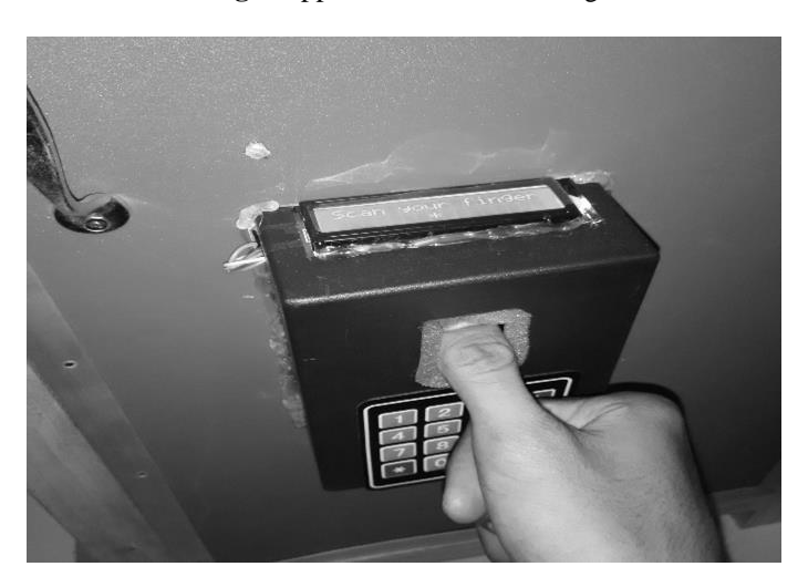
Fig 3 Doorlock with Fingerprint Prototype

Once the prototype is formed and functioning properly, we tested the tool with blackbox methods and scenarios are shown in Table 1. In Table 1 indicates that the fingerprint used in prototype working properly by the scenario that we have planned.