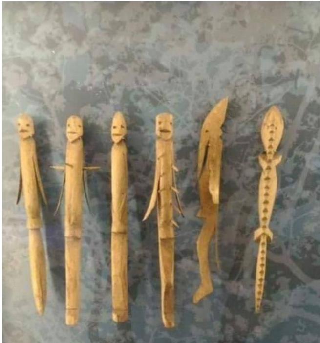
Figure 2. Example of “Sepilih” used in medicinal practices of Beni Soy

The skill in producing wood carvings is not only among the Jah Hut people, but also the Mah Meri. The only difference between these two is that the Jah Hut people are less known than the Mah Meri because they coped with the current technological changes and upgraded their production through a machine that helped them produce neat works. This argument has also been supported in previous studies where the Jah Hut people are less known than the Mah Meri people because they are more prominent and good at using available opportunities (N. E. A. Sani & Arif, 2021). In addition, the craft skills of wooden carvings are not only mastered by men but also by women. Women are often associated with handicrafts such as mengkuang mats, basket making, and so on. This argument is supported through interviews conducted with eight informants who are quite knowledgeable in the carving of statues of the Jah Hut people and have explicit knowledge about the Beni Soy ceremony. According to one informant in this Kuala Terbol village, a female carver is also exceptionally skilled in carving.