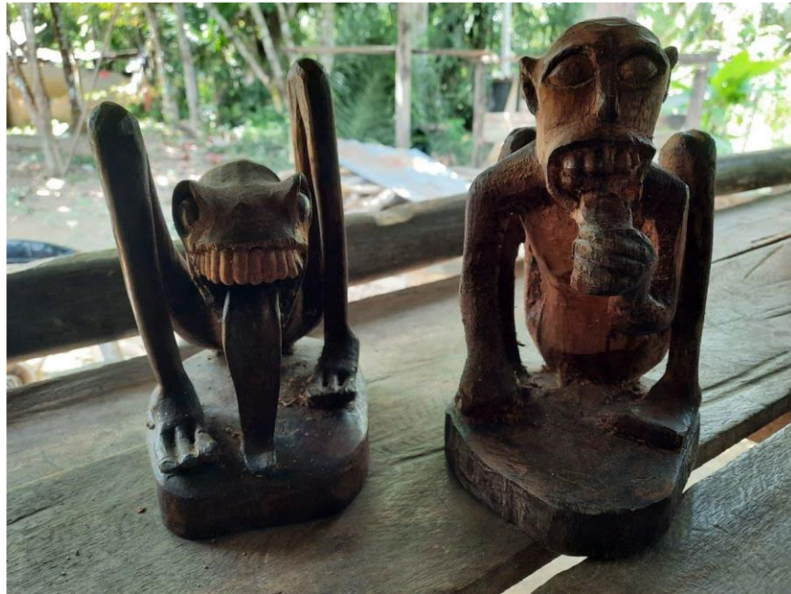
Figure 3. An example of Jah Hut wooden carvings produced by carvers