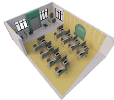
Figure 4. Multimedia Room Axonometry

Reading and Book Collection Room, this space is an open space that is intended for the general public, teenagers to adults. When entering the book collection area, visitors will be presented with various books. The atmosphere of the room is expected to be calm and relaxed. There are accents of Memphis motifs, in which there are various motifs such as Mega Mendung clouds, deer, clever weapons, taro leaves, Amorphophallus titanium flowers and a mixture of geometric shapes typical of Memphis.