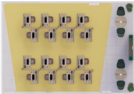
Figure 3. Multimedia Room Layout

Multimedia Room, when entering the multimedia area, users will be presented with several computers and audio facilities. The application of color space can increase work motivation, or improve the atmosphere. For example, choose yellow and orange colors that can offer a sense of warmth and comfort (Architectaria, 2015). Another use can be to use green to increase concentration.