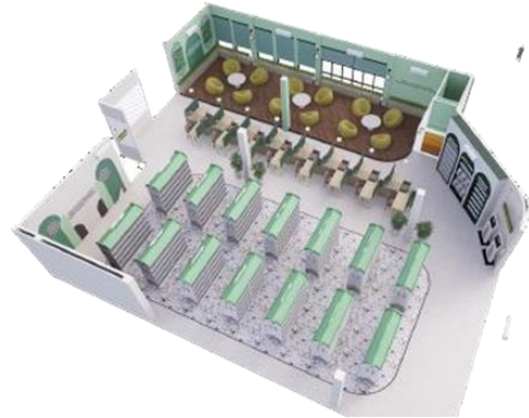
Figure 6. Book and Reading Room Axonometry