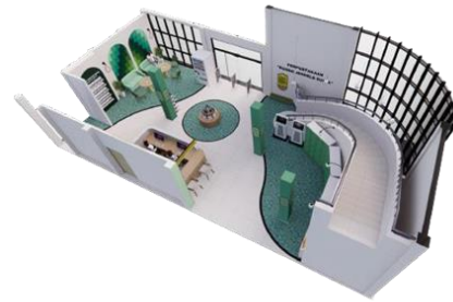
Figure 2. Lobby Axonometry

Multimedia Room, when entering the multimedia area, users will be presented with several computers and audio facilities. The application of color space can increase work motivation, or improve the atmosphere. For example, choose yellow and orange colors that can offer a sense of warmth and comfort (Architectaria, 2015). Another use can be to use green to increase concentration.