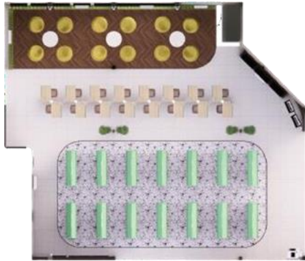
Figure 5. Reading and Book Collection Room layout