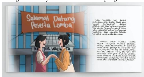
Figure 3. Content of Storybook "Tari Topeng Betawi"