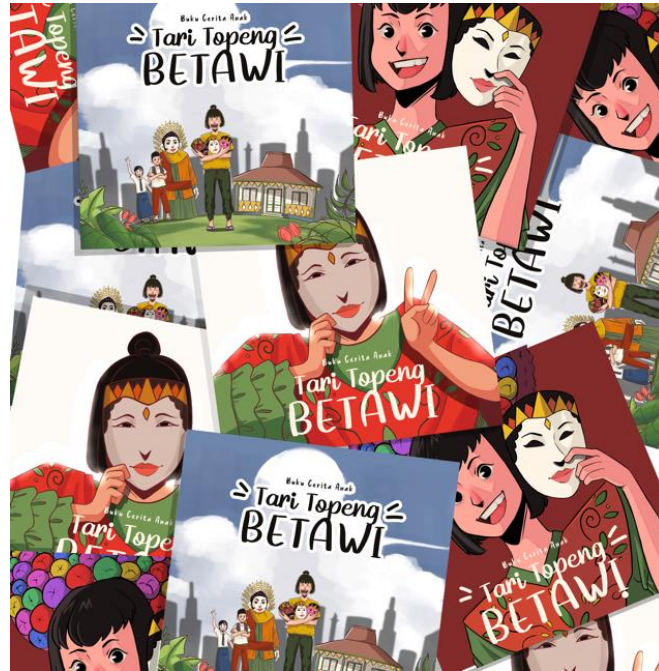
Figure 5. Color and Texture in “Tari Topeng Betawi”

The colors used will adjust to the part of the story that is presented, with a detailed final touching texture so that it can amaze and be liked by children.