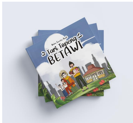
Figure 2. Storybook Cover "Tari Topeng Betawi"

This book was created to introduce one of the Indonesian cultures originating from the Betawi Tribe, namely Tari Topeng, as time goes by many children do not know about the cultures that exist in Indonesia. There are many factors that influence this, first, because of the lack of education from parents and teachers in schools about local culture, second, lack of interest in knowing about local culture, third, the difficulty of finding books and other media about local culture that are packaged in a unique and interesting way. Therefore, a book that discusses Tari Topeng which comes from the Betawi tribe, is made which is packaged with interesting illustrations.