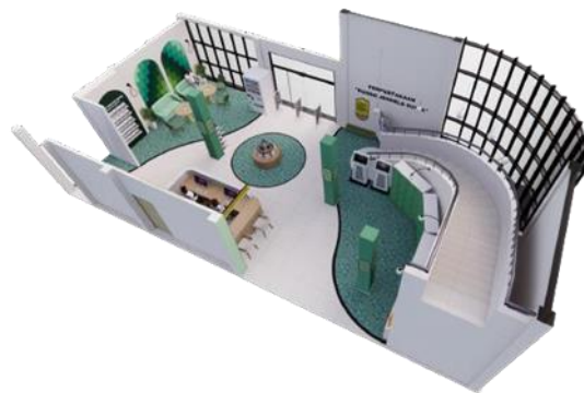
Picture 02 Lobby Axonometry