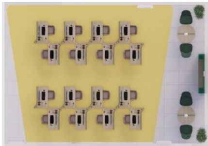
Picture 03 Multimedia Room Layout.

When entering the multimedia area, users will be presented with several computers and audio facilities. The application of color space can increase work motivation, or improve the atmosphere. For example, choose yellow and orange colors that can offer a sense of warmth and comfort (Architectaria, 2015). Another use can be to use green to increase concentration.