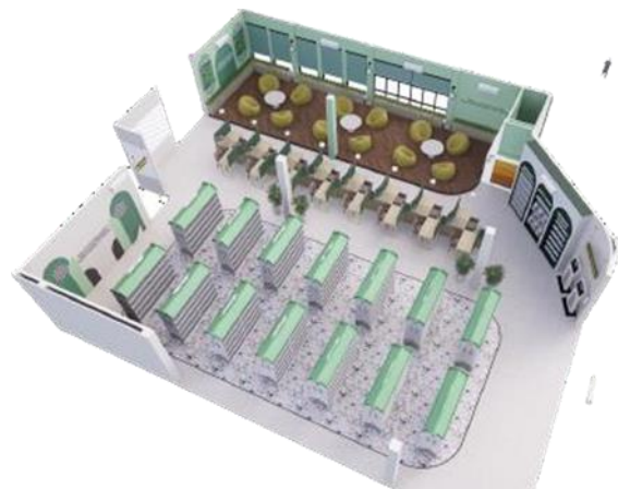
Picture 29 Book and Reading Room Axonometry