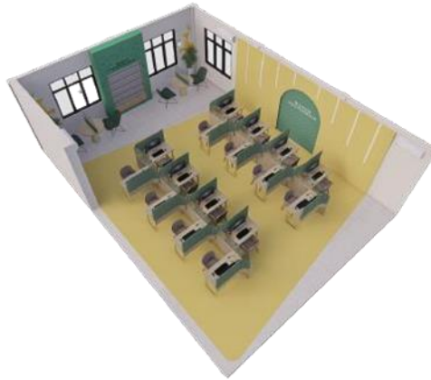
Picture 04 Multimedia Room Axonometry