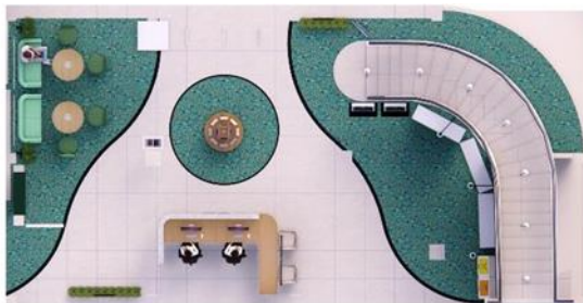
Picture 01 Lobby Layout

In the lobby, the room consists of a lounge/waiting area, a reception area and a locker area. The local content design in this space has batik accents from the buitenzorg library as an eye catching when you first enter the library. Batik ornaments use stainless steel material in the reception area while the columns use PVC wallpaper.