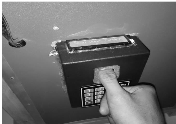
Fig 3 Doorlock with Fingerprint Prototype

Once the prototype is formed and functioning properly, we tested the tool with blackbox methods and scenarios are shown in Table 1. In Table 1 indicates that the fingerprint used in prototype working properly by the scenario that we have planned.