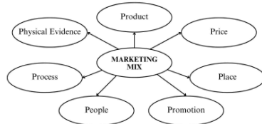
Figure 1. Elements of the Marketing Mix

In the 1950s, Borden proposed a fundamental concept in marketing called the marketing mix. McCarthy then developed this marketing mix theory into four main elements, commonly referred to as the 4Ps: promotion, place, price, product. This theory was later expanded and refined into the 7Ps, which is a combination of marketing, strategy, and tactics used by an individual or organization in marketing their goods and services (Thabit et al., 2018). According to Do et al. (2020), industries use the 7P strategy to meet customer needs and desires. 's marketing mix theory aims to help companies develop effective marketing strategies by harmoniously integrating the seven elements. It aims to generate customer value, satisfy market demands, and foster sustainable customer relationships through the coordinated implementation of its seven key elements.