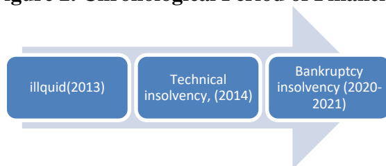
Figure 2. Chronological Period of Financial Distress of PT Garuda

Recently, PT Garuda Indonesia, is in the bankrupt insolvency. The indicator in the financial analysis can be seen from the number of equity is smaller than liabilities. Most of the companies are debt obligations to the lessor, namely the party who leases the aircraft to Garuda. So far, there has been mismanagement of aircraft rental fleets ranging from more expensive rental prices, various types of aircraft leased and also decisions about the quantity and quality of lessors, so that the burden of operational costs increases. During the pandemic in 2020, mobility restrictions affected Garuda's financial performance even more difficult, as losses accumulated. Pranomo et al (2010) added that insolvency condition leads to bankruptcy. Other opinion states that Bankruptcy can be classified as technical insolvency bankruptcy and legally bankruptcy. The position financial distress of PT Garuda Indonesia in the insolvency bankruptcy due to the liabilities is higher than equity. According to Halim and Hanafi (2018) financial distress can be solved by informal and formal action. Formal action can be done if the problem is worst such as financial PT Garuda Problems. It can be solved by reorganization, by changing capital structure to be eligible capital structure or liquidation by selling its assets.