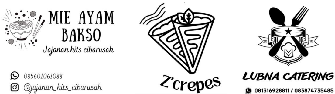
Figure 2. The result of custom stamp by canva apps

The result of this activity is a stamp design that can be use on many types packaging. The ink used is a special ink that can be used on all media such as plastic, plastic bag, food containers, paper, Lunch box, beverage cups, etc. The following are the results of the stamp design that has been made by participants :