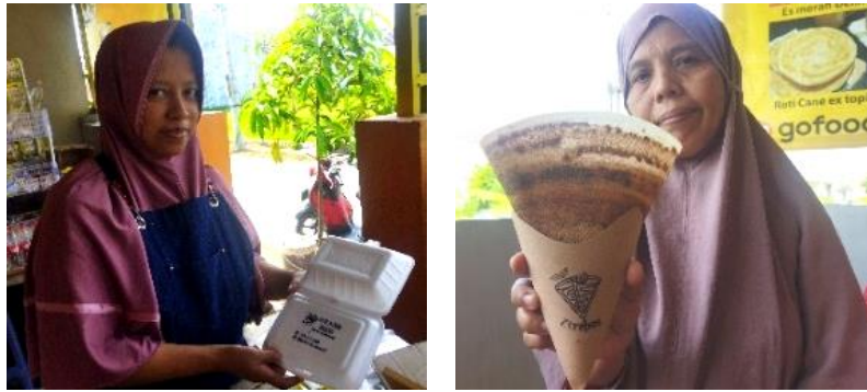
Figure 3. Custom Stamp results on styrofoam and paper packaging

Some things that are important is to making a simple design, not to use a lot of words, just include a simple image or logo that makes the logo more memorable and aesthetic.