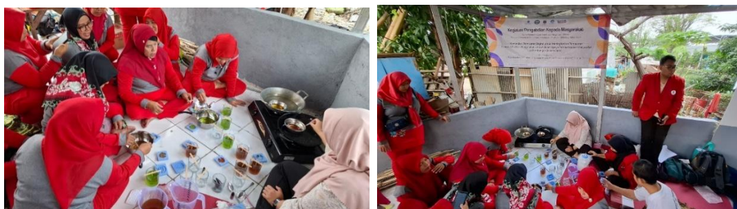
Figure 5. Training on processing used cooking oil into candles.

The next step is to mix the heated oil with additional ingredients such as paraffin wax or beeswax, which serve as binders and texture enhancers for the wax. Participants will also be given the opportunity to add natural dyes and fragrances if desired so that the resulting candles have an appealing appearance and scent. Once the mixture is ready, participants will pour it into the pre-prepared candle molds. At this stage, they will also place the wick in the center of the mold so that the candle can be lit after it hardens. After the wax is poured, participants must wait for it to cool and solidify. This process takes time until the candle is truly ready to be used.