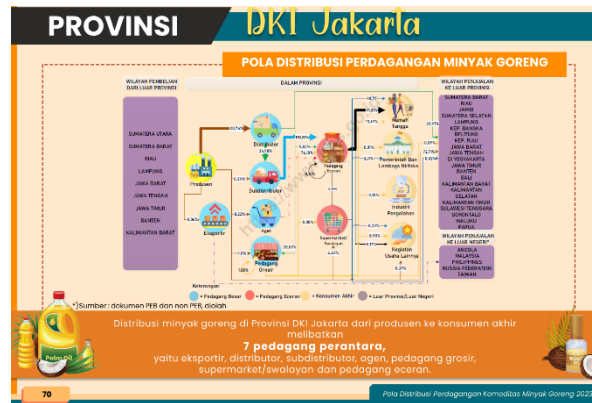
Figure 1. Distribution Pattern of Oil Trade in DKI Jakarta (BPS 2023)

Figure 1 explains the distribution pattern of oil trade from producers to consumers in DKI Jakarta. According to the 2023 BPS statistical data (BPS, 2023), it was recorded that 91.01% of oil sales from Retail Traders, 98.77% from Supermarkets/Hypermarkets, and 13.67% from Wholesalers were purchased by household consumers. Based on research conducted by the Traction Energy Asia research institute on households and micro-enterprises, the potential contribution of used cooking oil producers in DKI Jakarta is estimated to reach 154 thousand Kiloliters (KL) per year (katadata.co.id, 2024).