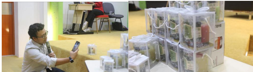
Figure 6. Photography and Videography Workshop

After the introduction of the theory, participants are invited to practice taking photos of their candle products directly. They will be guided to try various angles, utilize natural or additional lighting, and set up a simple yet appealing background. After the photography session, it continued with the videography session. In this activity, the PKK mothers will learn how to record videos showcasing candles from various angles, highlighting the packaging details, and how the candles are lit.