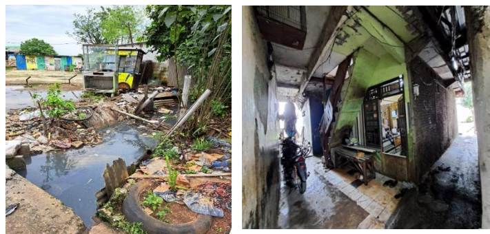
Figure 2. The Existence of Limited Land Amidst Residential Areas and the Condition of Population Density in Housing

In this case, there is a situation that needs to be reviewed regarding the issue of used cooking oil waste in DKI Jakarta, specifically in the area of RT 15, RW 06, Kembangan Utara Village, Kembangan District, West Jakarta. Based on discussions with the local neighborhood head and field observations, it was found that out of a total of 220 households in the area, there are difficulties in managing waste from used cooking oil. Moreover, the area is densely populated with very close housing, and the lack of drainage systems creates potential problems in various aspects.