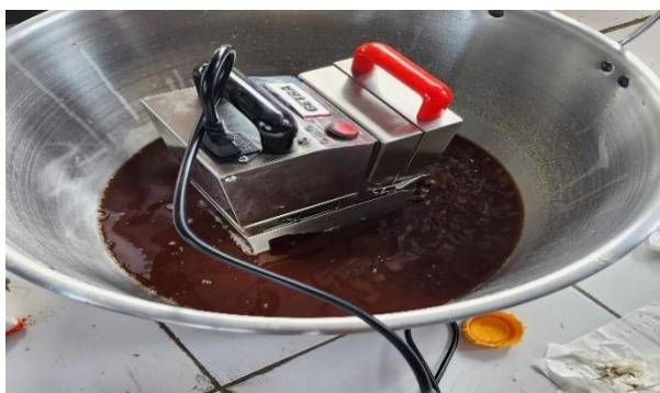
Figure 4. Used cooking oil filter machine

After the socialization activities were carried out, the training on processing used cooking oil into candles took place on July 18, 2024, located in the PKK RW 06 hall. In this training, participants go through several stages of activities step by step. First, the participants were divided into several groups and then explained the preparations for processing used cooking oil. Each group of participants is asked to filter the used cooking oil that has been collected to remove any dirt or food residue still present in the oil. After the oil is filtered, they then heat it over a low flame to ensure that the used cooking oil is in a liquid state and easy to mix with other ingredients.