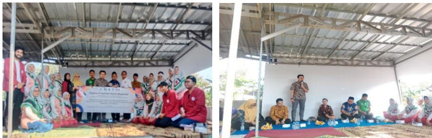
Figure 3. Socialization Activities

The first activity conducted was a socialization event regarding used cooking oil, held on July 4, 2024, at the PKK RW 06 hall. The socialization regarding the management of used cooking oil began with a presentation explaining the negative impacts of improperly disposing of used cooking oil on the environment. At this stage, the community is introduced to issues such as water and soil pollution caused by discarded cooking oil. Furthermore, the socialization introduces the concept of recycling and sustainable management of used cooking oil, which has the potential for economic added value, by providing examples of products that can be produced from used cooking oil, such as soap, candles, or biodiesel. Then, this activity concluded with the practical application of technology for filtering used cooking oil using an oil filter machine.