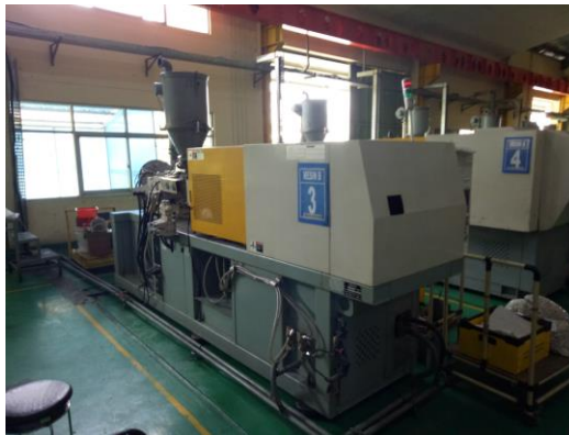
Figure 3. Injection molding machine Toshiba IS 350 GS 350 Ton

Injection molding is one of the processes most often used to produce plastic components, where the printing cycle process runs quickly through an ejection process where liquid plastic fills the mold followed by a cooling process (Raos, 2014).