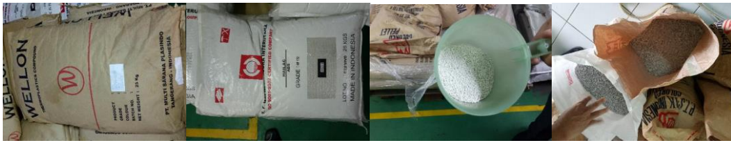
Figure 2. Raw material in the form of plastic ore

The main material used in this research is ABS plastic ore. The raw material will then be processed by melting the plastic ore and printing it to form the desired product (speaker spare part).