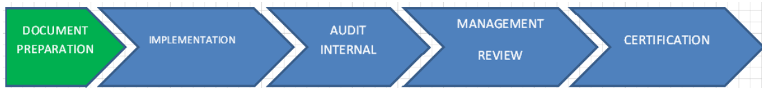
Figure 1 Stages of ISO certification preparation

In general, before the ISO certification process is carried out, there are stages that must be passed first by the company so that during the certification audit the company can be recommended to get ISO certification. These stages are commonly used by management consultants in helping their clients get ISO certification. The preparation stages for ISO are as shown in Figure 1.