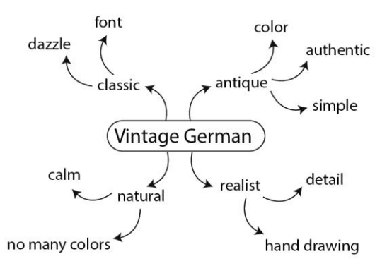
Figure 3. Conceptual Graphic Idea Mahlzeit N 'Das Brot

messages effective and communicative. So expect upscale target market will more and more are interested to buy bread in Mahlzeit n 'Das Brot. Figure 3 bellow, allows us to follow the conceptual idea of the graphic.