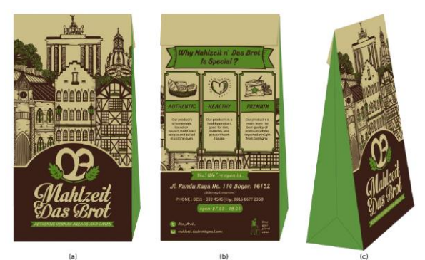
Figure 7. Packaging Mahlzeit Bread n 'Das Brot: Front (a), Rear (b), and Side (c)

Additionally, the first comprehensive design is the most convenient design and suitable for application to products by Mahlzeit n 'Das Brot, such as cakes and sandwiches, because they do not have the look of bakery products itself. Hence products other than bread can also use this illustration. Graphic packaging application in design is depicted in Figure 7 and 8.