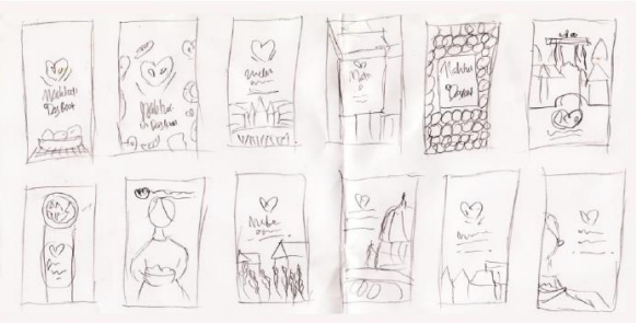
Figure 4. Rough Sketch Tumbnail

With exclusive packaging along with memorable characters that have a distinctive German design, Mahlzeit n 'Das Brot is able to show vintage style which strengthens the authentic elements of bread. In addition, at the front of the pack there are logos and product illustrations and photos. On the back, there is the full address, phone numbers, a reminder not to litter, and descriptions of the excellenct quality of the products produced by Mahlzeit n 'Das Brot. SKETCH.