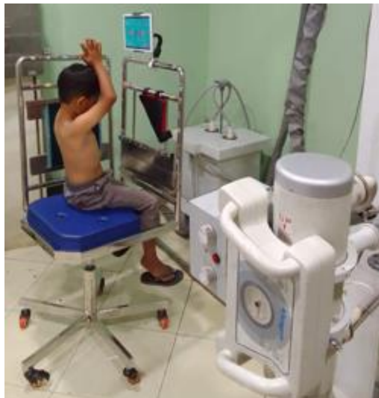
Figure 3. Fixation of a pediatric patient's thoracic radiograph in lateral position