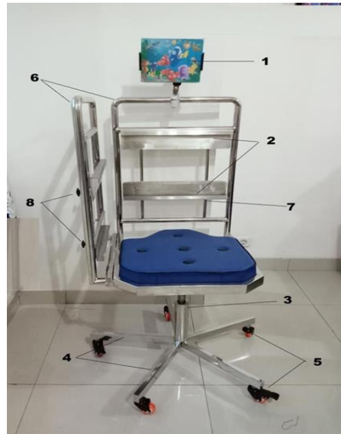
Figure 2. Pediatric fixation equipment for chest examinations