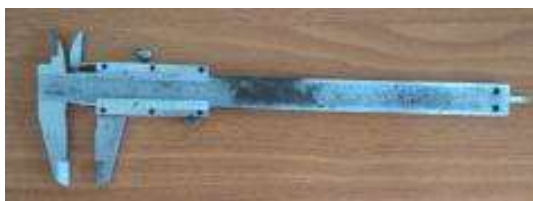
Figure 7. Caliper