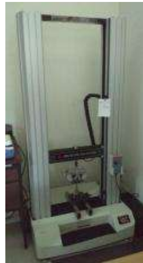
Figure 10. Mechanical strength testing machine

The materials are used to print specimens, such as polymethylmethacrylate (PMMA), methylmethacrylate (MMA) and hydroxyapatite (HA). The materials are mixed manually to obtain a homogeneous mixture. After that, some mixture is included in the injection. This is done to see the mixture passes through the nozzle. Most of the residual mixture is fed into a mold that can make five specimens in one experiment. The mold is coated with a lip moisturizer (as