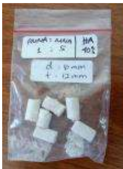
Figure 13. Specimens with PMMA composition: MMA = 1 : 5 (w/w) with a percentage HA of 40%

The fourth experiment was performed on a commercial composition ratio, the composition of PMMA: MMA = 2 : 1 (w/v) with a percentage of 5%, 10%, 15%, 20%, 25%, 30%, 35%, 40%, 45%, and 50%. These materials mixtures have