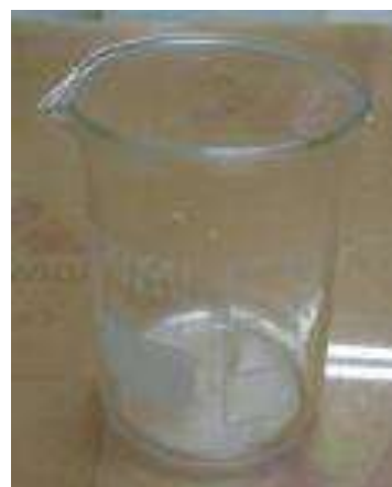
Figure 3. Measuring cup