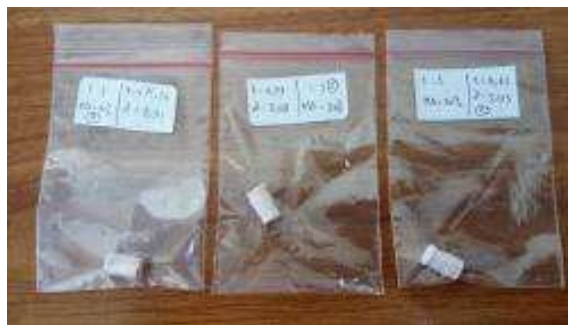
Figure 11. Specimens with PMMA composition: MMA = 1: 1 (w/w) with a percentage of HA 20%

The first experiment was conducted based on research conducted by Samad & Jafaar (2009), the composition of PMMA: MMA = 1: 1 (w/w) with a percentage of HA mixture of 0%, 20%, 40%, and 60%. In a material mixed with 60% HA percentage, the mixture of this material does not mix homogeneously and it is still grained. Therefore, the mixture of this material is could not pass through the nozzle.