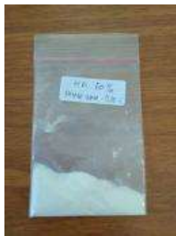
Figure 12. Specimens with PMMA composition: MMA = 0.75: 1 (w/w) and a percentage of HA 60%

The second experiment was based on a study conducted Samad & Jafaar (2009), the composition of PMMA: MMA = 0.75: 1 (w/w) with a percentage of 60% HA mixture. It is done to know the material can be mixed homogeneously or not with the reduction of PMMA powder material composition. As a result of this mixture, the material does not mix homogeneously and it is still grained. Therefore, the mixture of this material is could not pass through the nozzle.