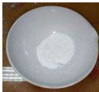
Figure 2. Porcelain bowl