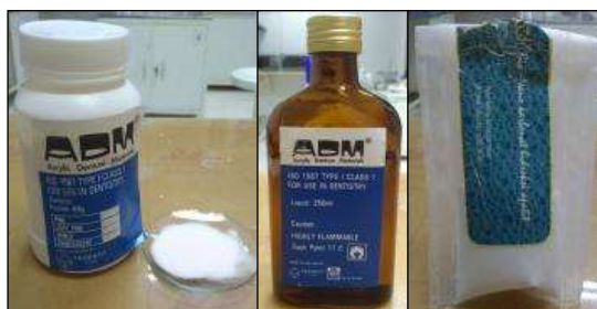
Figure 1. Main Material

machine because it has a short solidification time (Utami, 2016).