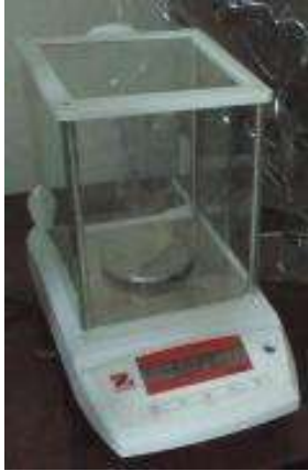
Figure 4. Digital balance, Brand Ohaus with accuracy 0.0001 gram