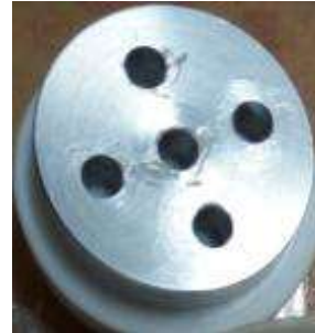
Figure 9. ASTM F451-95