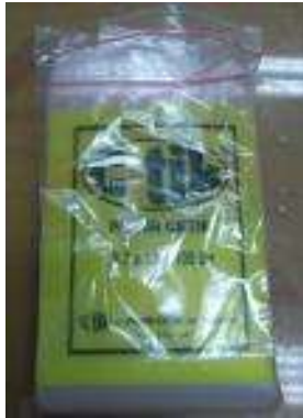
Figure 5. Plastic sample