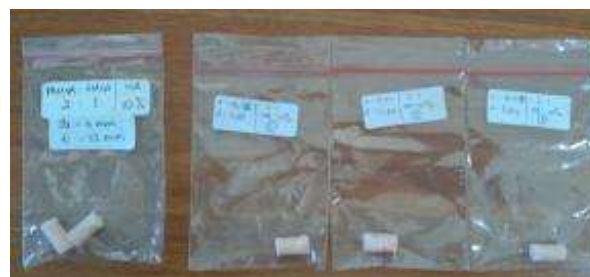
Figure 14. Specimens with composition PMMA : MMA = 2 : 1 (w/w) and percentage HA 10%

material characteristics, different specimen conditions and solidification time on each material mixture. The difference can be seen in Table 2.