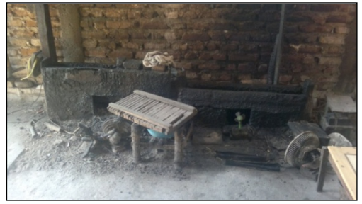
Figure 3 Some Equipment in Making Satay, Rice Cake and Sauce

From the figure 4 it can be seen that the satay maker pay less attention to the hygiene and the cleanness of their production room or kitchen. Indeed the combustion/baking process produces a lot of smoke and dust. However, the people in this