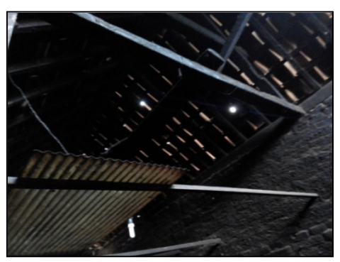
Figure 4 Condition of Ceiling

From the figure it can be seen that the lighting just come from the ceiling and ventilation. In some houses, there is no exhaust system. The exhaust system is only from the door, ceiling and ventilation. When seen from the quality of the lighting, ceiling and ventilation, there is no adequate quality there. Inhabitant gives no attention about that. Some people often complaining about sore throat and infection in respiratory. But, after recovery from sickness, they seemed to forget the origin of the sickness. Some people said that they prefer gain more money rather than give more attention to the condition of the house or their health. The ceiling conditions as shown at the figure not only give the sickness but also interferes the cleanness.