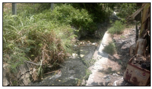
Figure 5 Drainage as waste disposal

The people throw their waste disposal, both personal or production disposal, directly to drainage channel. From the figure above it can be seen that drainage channel is blend