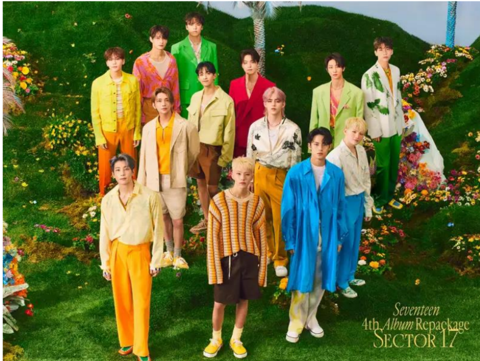
Figure 2. All members of K-pop Boy Group Seventeen

sub-units aim to divide them based on their talents. Hip-Hop Team for those who are talented in rap, Performance Team for those who are talented in dancing, and Vocal Team for those who are talented in singing. Seventeen is also nicknamed Self-Producing Idol , which means they are idols who produce their own work. Seventeen members are directly involved in the production process of songs, albums, choreography, concerts and merchandise (Bacin, 2018).